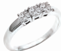
Prong set 0.25 cttw only $699 0.50 cttw only $999 1.00 cttw only $1,999