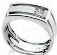
For Him 0.20 ct only $1,299