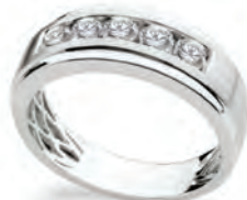
For Him 0.80 cttw only $1,899