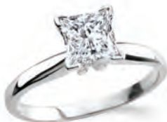
1.00 ct Princess Cut from $2,995 to $5,999